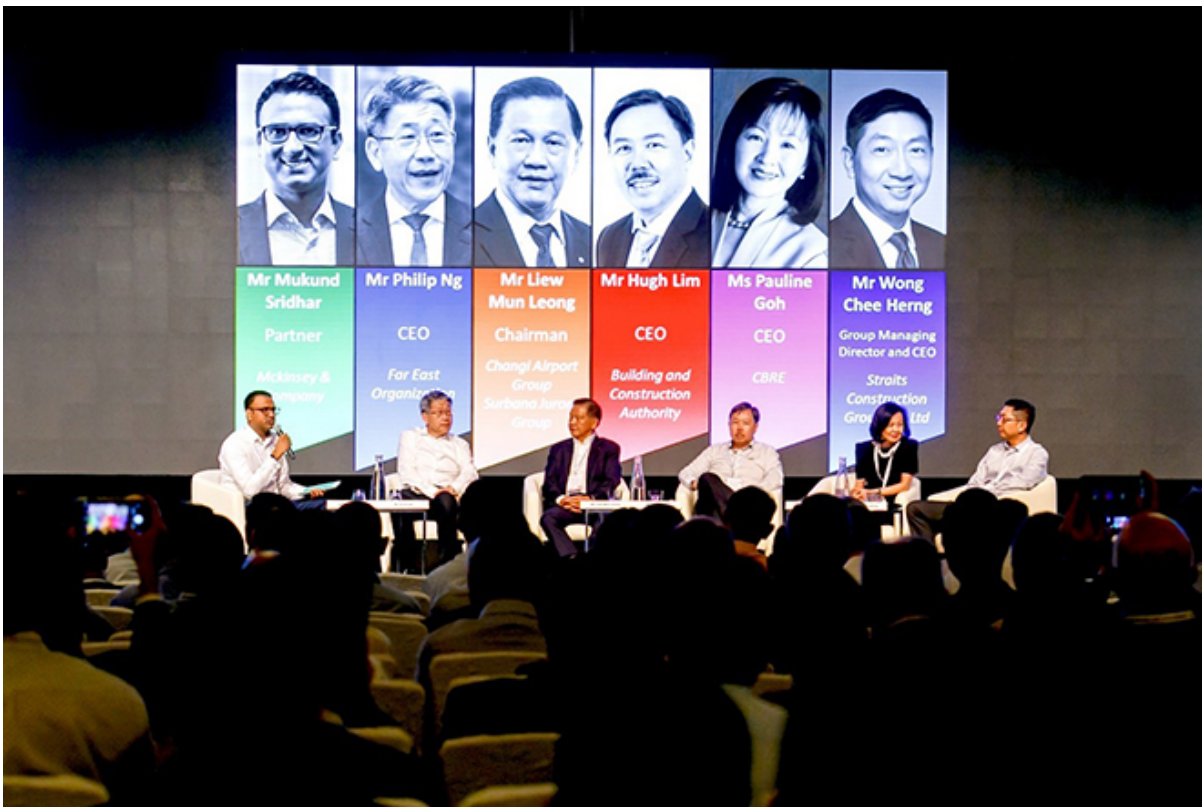
Panel discussion at the Breakfast Talk for CEOs