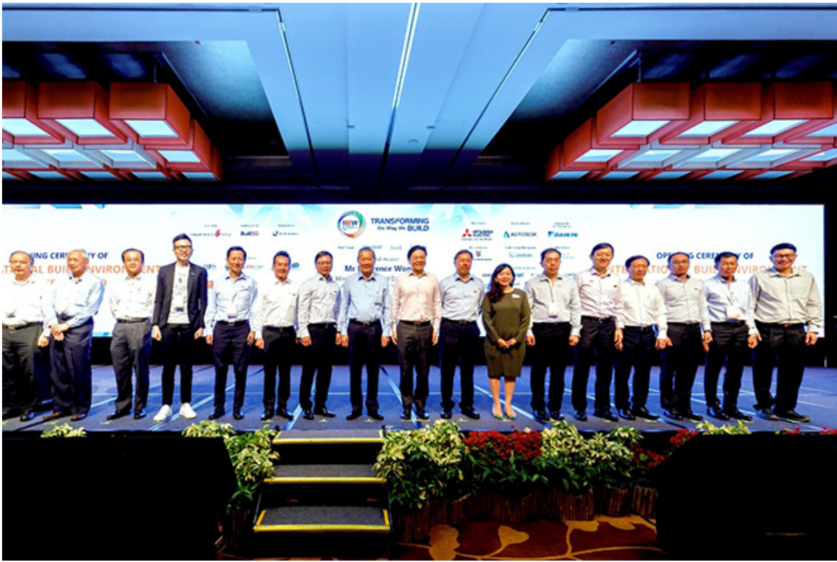
Guest-of-Honour Minister Lawrence Wong and other VIPs graced the opening ceremony of IBEW 2019