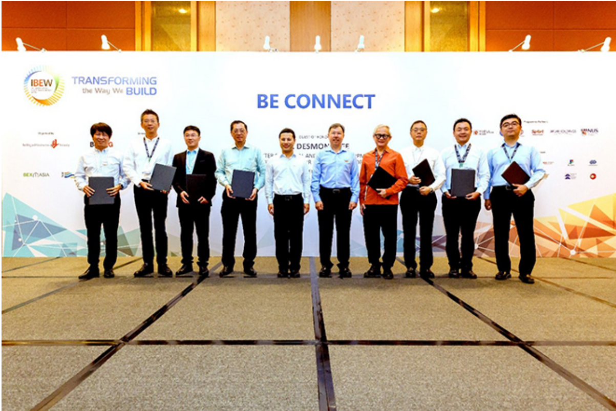
Presenting the signed Memoranda of Understanding at BE Connect