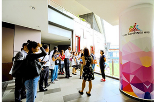
Delegates on the site tours to Jewel Changi Airport (left) and Our Tampines Hub (right)