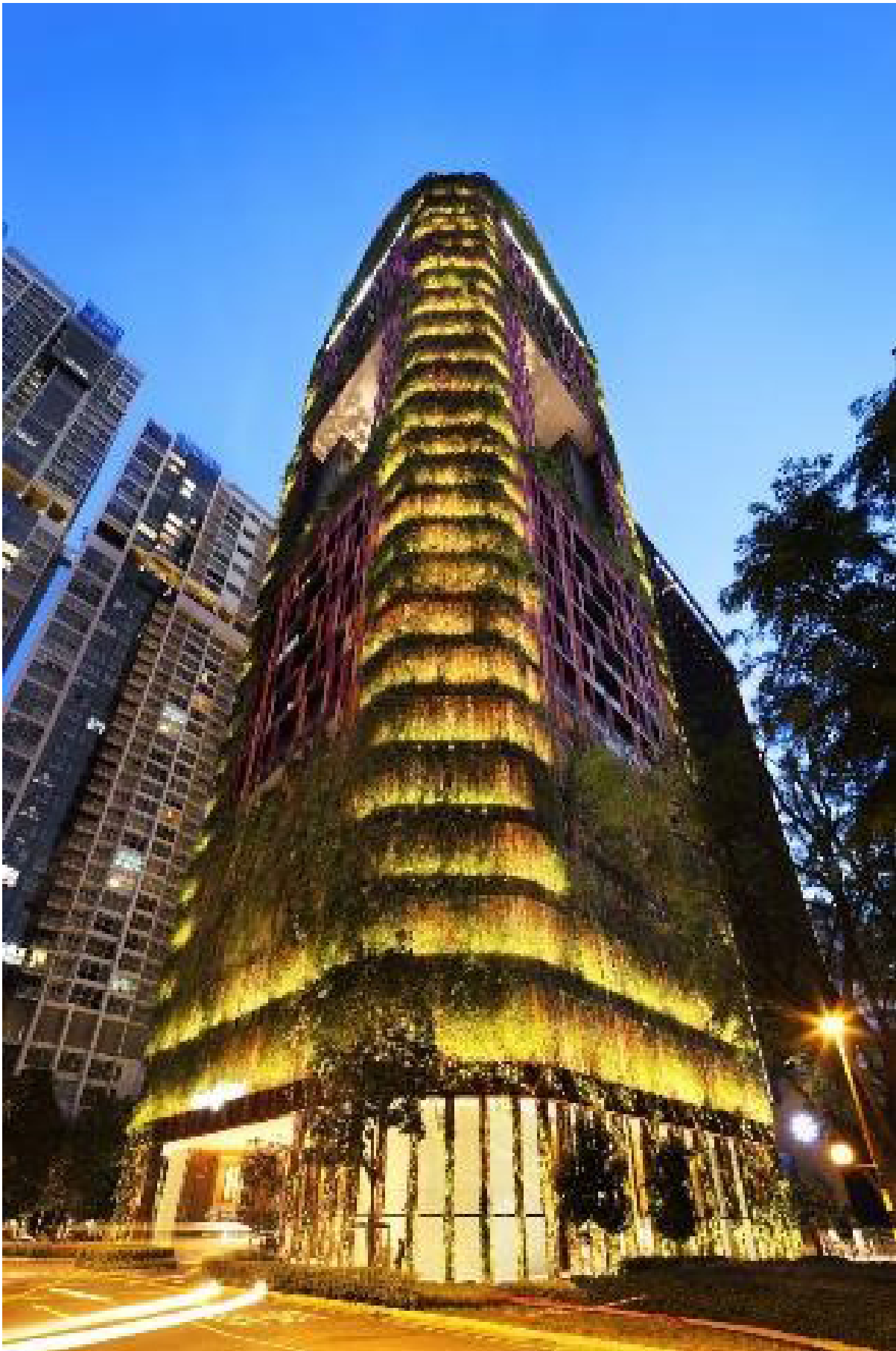
The Oasia Hotel Downtown by WOHA Architects Pte Ltd reinvents the typology of mixed-use towers in the city by introducing creeping plants over the building skin.