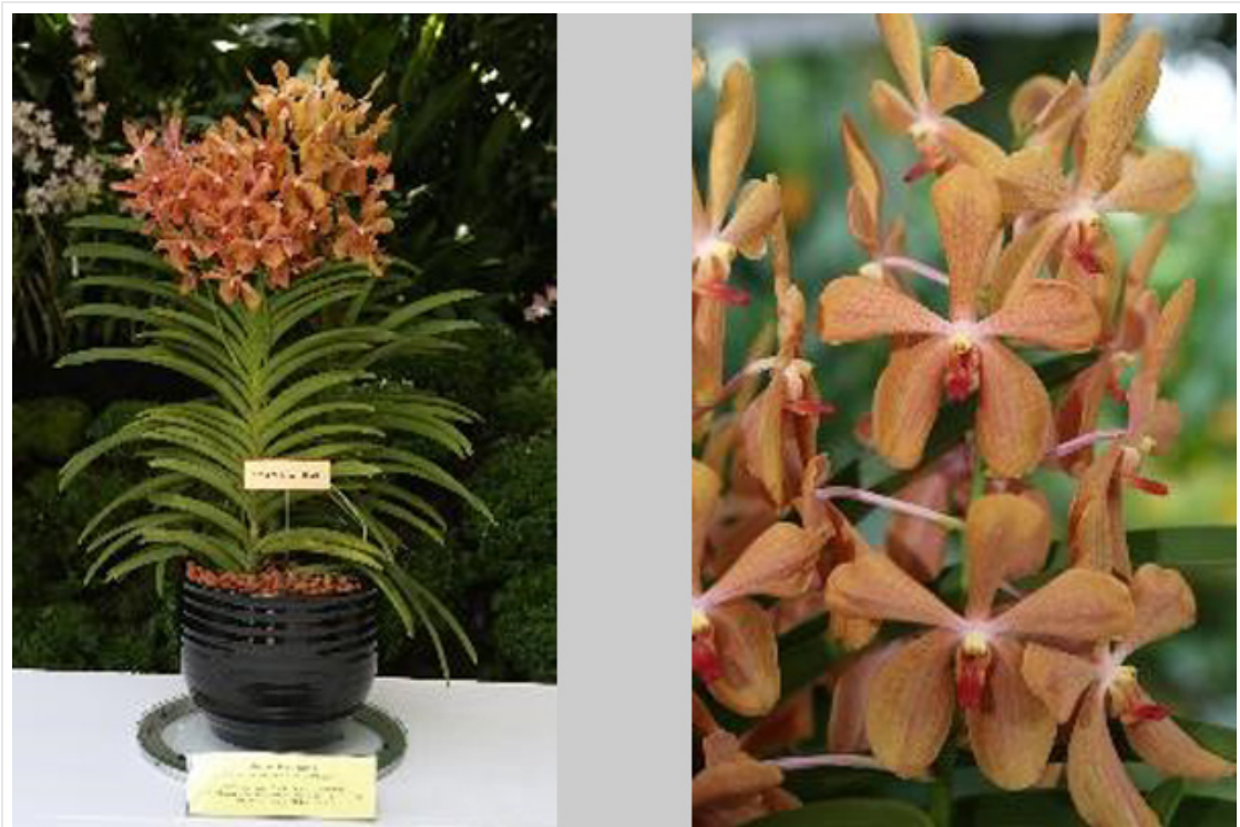
The Aranda Mark Rutte.

Aranda Mark Rutte is a robust and vigorous hybrid that produces upright flower sprays bearing up to 12 striking and well-arranged blooms, each measuring about 8cm across. The sepals and petals are an attractive salmon-orange adorned with fine crimson spots, with a contrasting crimson lip complementing each bloom.