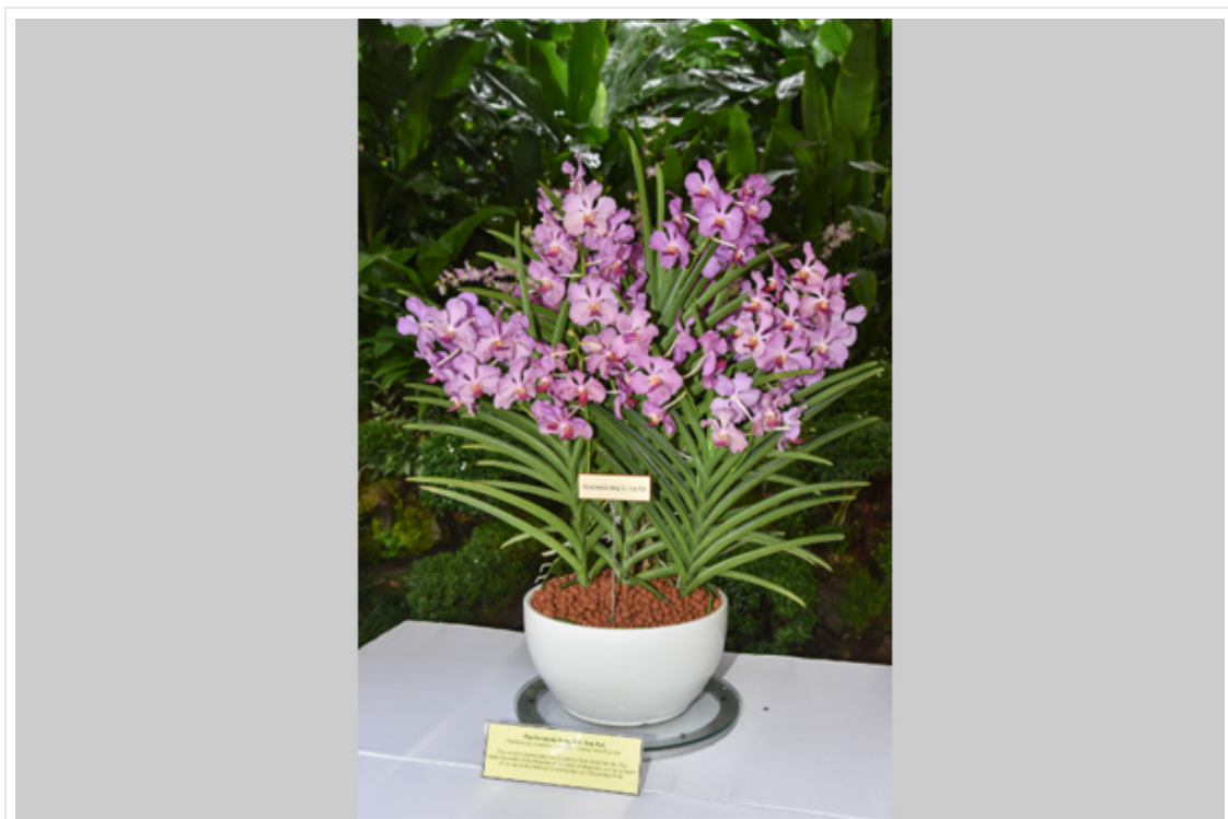
The Papilionanda Aung San Suu Kyi.

Papilionanda Aung San Suu Kyi is a robust and free-flowering hybrid that produces strong upright flower sprays, each bearing up to 10 large and attractive blooms. Each bloom measures about 9cm across. The sepals and petals are a delightful pastel bluish purple adorned variously with fine purple spots and tessellations. Each bloom is complemented by a prominent waxy reddish-purple lip.