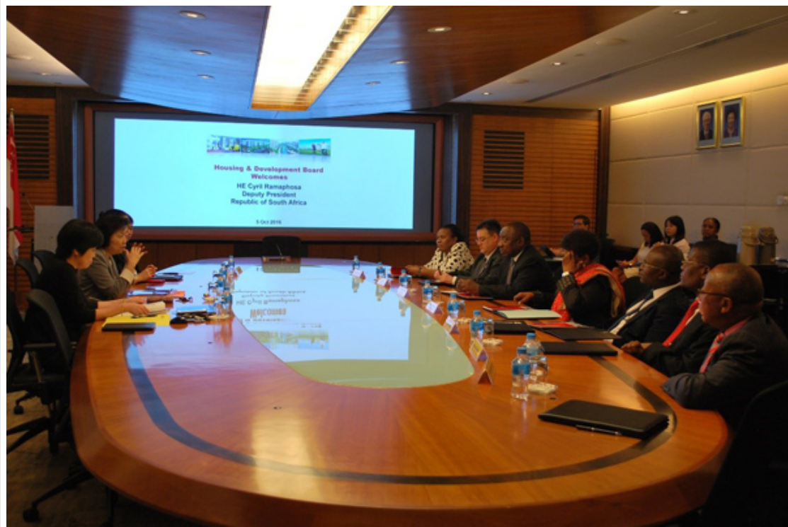
HDB CEO (second from the left) gave a short introduction on HDB.