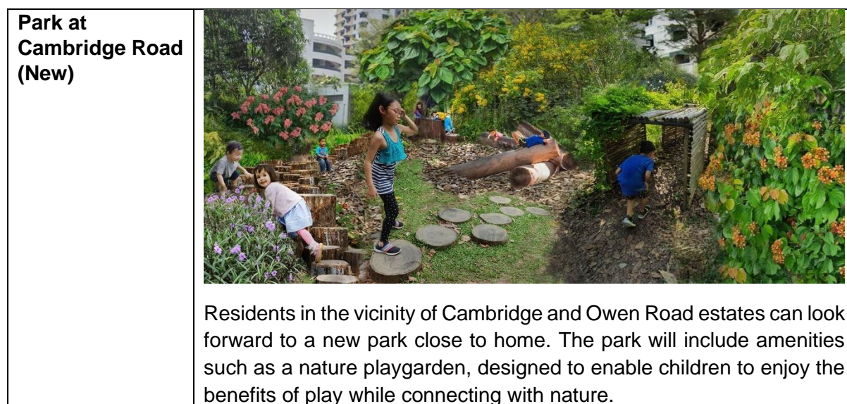
Table 1: Examples of new and enhanced parks to be developed/redeveloped

NParks will be developing over 130 hectares of new parks and redeveloping about 170 hectares of existing parks and gardens, between now and 2026. These will feature intensified greenery and upgraded facilities, providing Singaporeans with access to lush greenery and nature. For example, NParks will be implementing natural designs and plantings in the new and enhanced parks to recreate the look and feel of natural forests. NParks will also work with PUB to naturalise waterways and waterbodies where feasible. This is a nature-based solution that can enhance flood resilience for nearby homes and properties while beautifying the environment and providing habitats for biodiversity. In addition, NParks will be incorporating therapeutic landscapes in some of these new and enhanced parks. Such therapeutic gardens can provide park visitors with a range of health benefits such as relief of mental fatigue, reduced stress, and an overall improvement to emotional well-being. Refer to Table 1 for some examples of the new and enhanced parks which Singaporeans can look forward to.